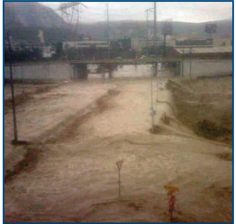
Severe flooding in Monterrey, Mexico, July 2, 2010.

The worst of the 2010 hurricane season is yet to come. Putting measures in place now may save millions in the coming months.