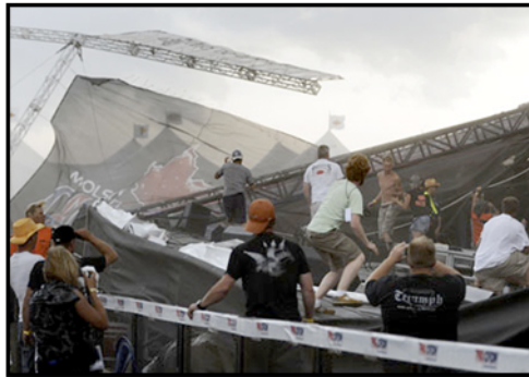
The collapsed stage viewed through blowing dust raised by the high winds.

These unfortunate events illustrate, once again, the vital nature of advance planning for emergency weather conditions whenever large numbers of people gather, whether indoors or out. By having a practiced plan, lives can be saved and injuries prevented. An essential element of the plan is having a dedicated weather partner specifically focusing on your venue.